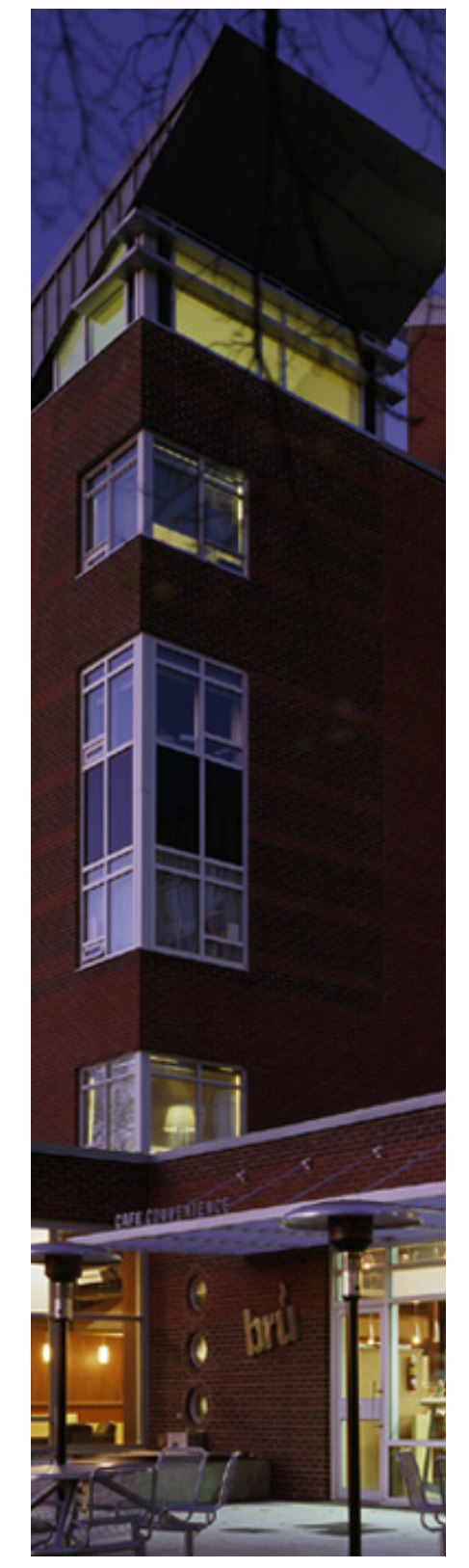
THE CONSTRUCTION SOURCE CANADA

illustrate the new values of the county and the new spirit they've got going. That's been a pretty exciting thing to be a part of."