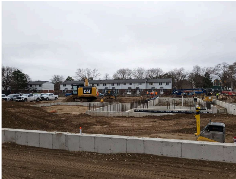
Ongoing construction at the site of phase one of the Reimagine Southdale project.