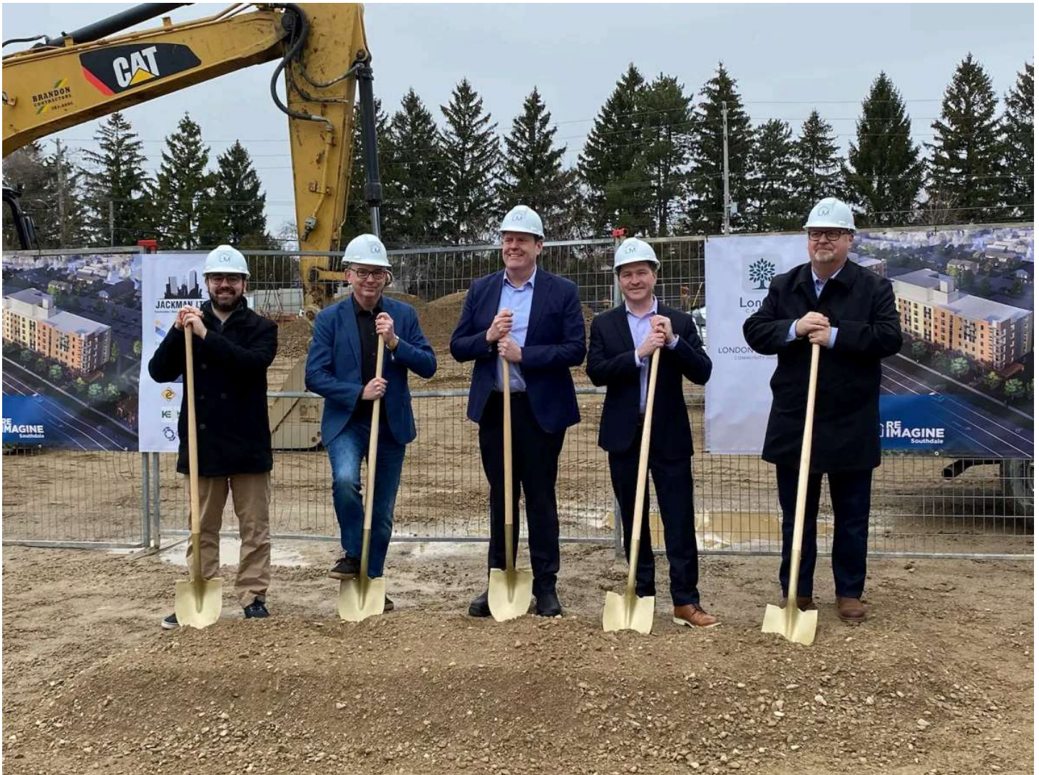
Officials from both the city and LMCH were present Wednesday, March 6, to break ground on phase one of Reimagine Southdale.